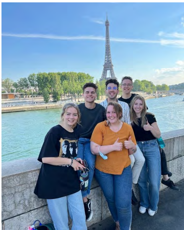
Omega Global – Europe Trip 2022

In March 2003 Western Pentecostal Bible College was renamed Summit Pacific College by an act of the British Columbia Provincial Legislature. The prospects for Summit Pacific College continue to be both encouraging and challenging. Sacrificial efforts by a host of dedicated participants and friends have built a solid foundation. Spiritually, academically, and financially Summit is firmly established. Through 80 years of ministry the college has experienced much progress.