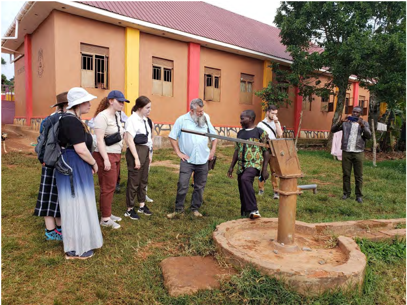
NPOL 203 Introduction to Community Development Uganda 2022