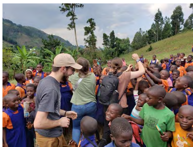
NFPL 203 Introduction to Community Development Uganda 2022