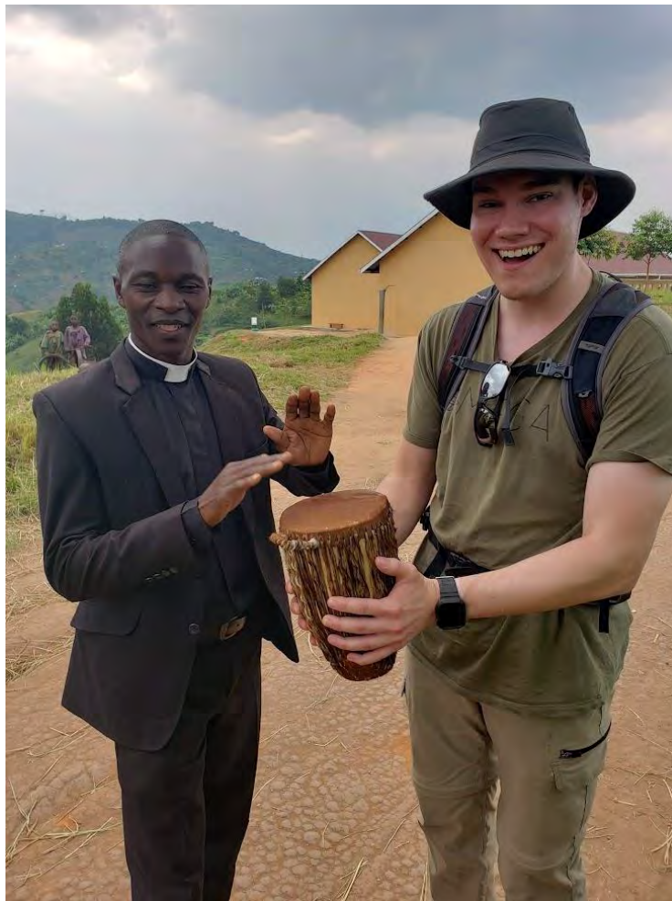
Intercultural Studies Internship – Uganda 2022