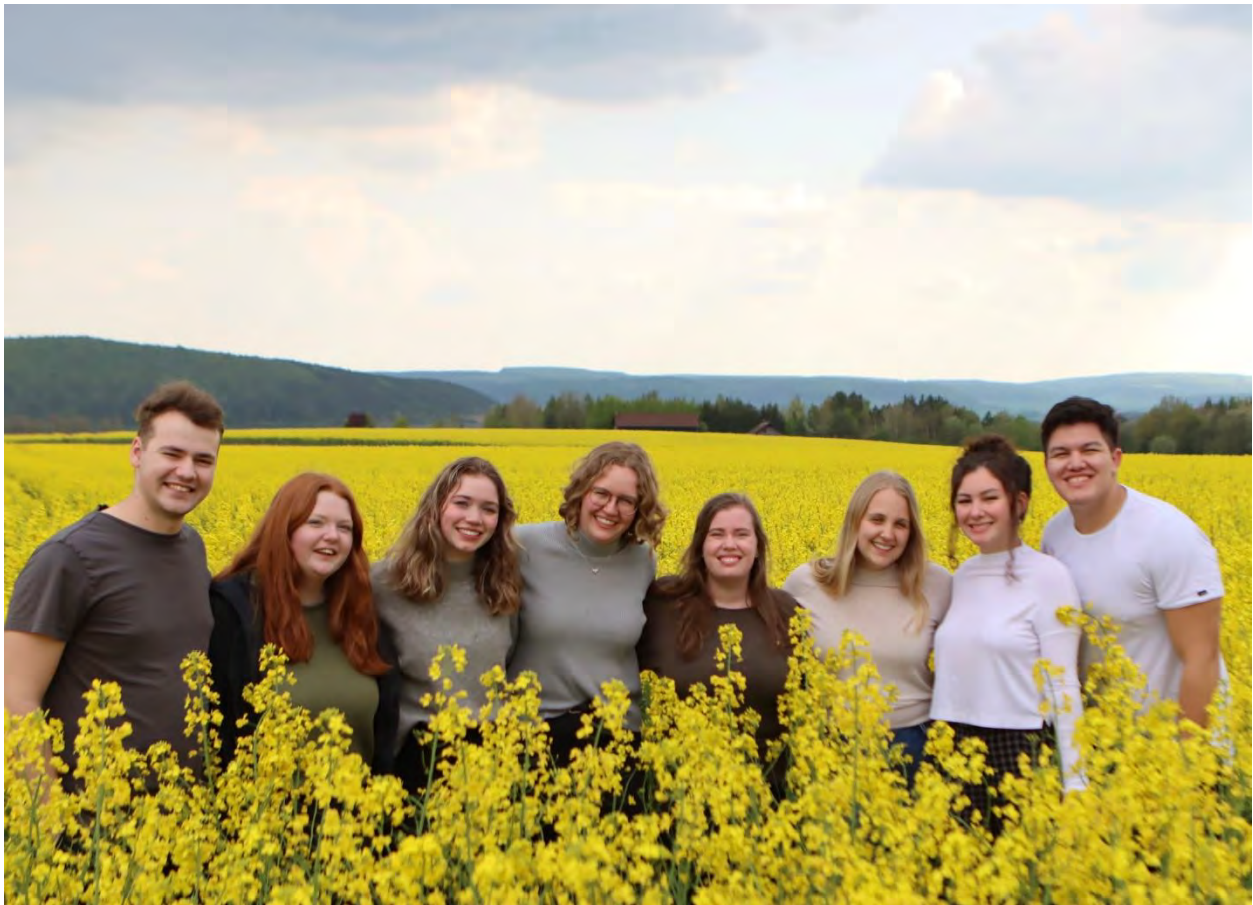
Omega Global – Europe Trip 2022